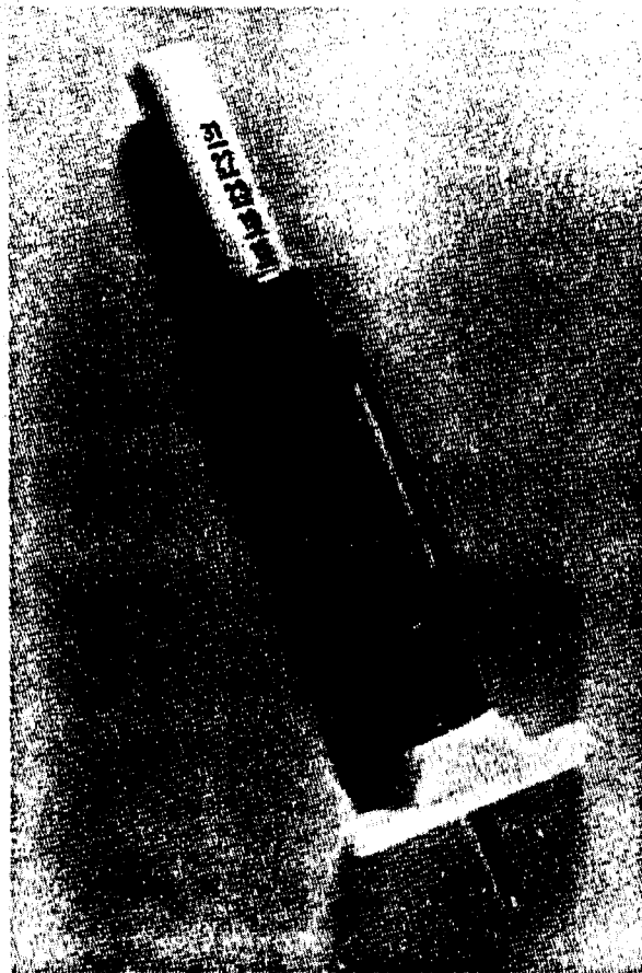
Figure 1 Depth Measuring Gauge

With the depth gauge guides in contact with the original concrete surface, the plunger is depressed until contact is made with the bottom of the groove in the concrete. The gauge is then removed