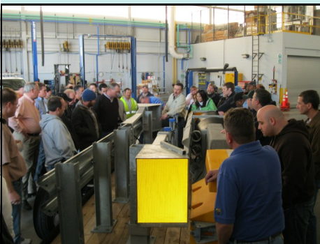
Hands-on Experience from Manufacturers