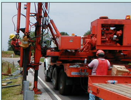
Common Installation Procedures