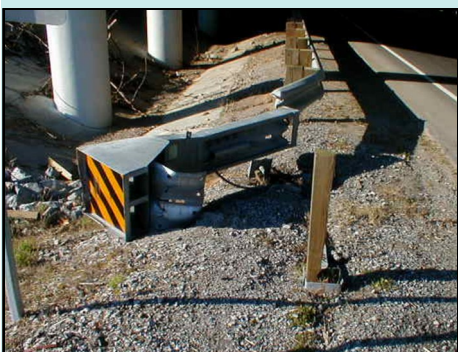
Repair or Upgrade?