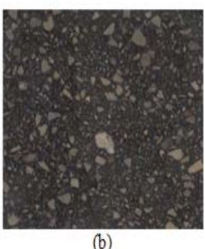
Figure 1 Cross sectional image of (a) a NMAS 12.5-mm asphalt mixture specimen; (b) a NMAS 4.75-mm asphalt mixture specimen [Ho, CH., González, M.F.M. & Linares, C.P.M. Front. Struct. Civ. Eng. (2017)]

Asphalt mixtures with a smaller NMAS can be used for reducing the