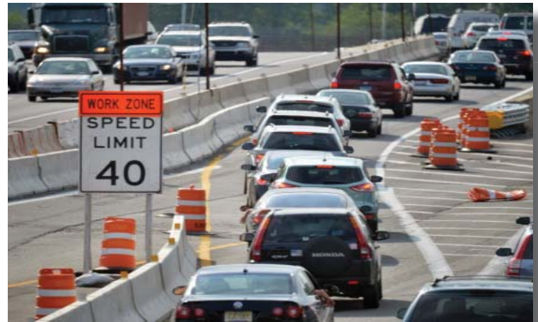
Figure 1 Traffic queue at workzone

and analysis tools have been developed for analyzing traffic mobility issues, with some specifically designed for work zones.