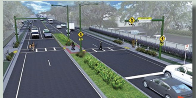
Figure 1 Traffic calming facilities at crosswalk

The research team will first conduct a comprehensive literature search for legislation on provision of pedestrian crossing facilities on high-speed urban arterials. The literature review will focus on documenting all the available types of pedestrian crossing facilities, definitions of high speed arterials, policies adopted by other states for pedestrian crossing facilities on high speed arterials, legislation disallowing pedestrians on roadways other than interstate, classification of regions into urban, suburban, or rural, and inform on traffic studies needed to provide different types of pedestrian crossing facility on high speed urban arterials. Then, information regarding crashes involving pedestrians (fatal and serious injury) will be collected for most-recent available 5 years. From this compiled inventory, analyses will