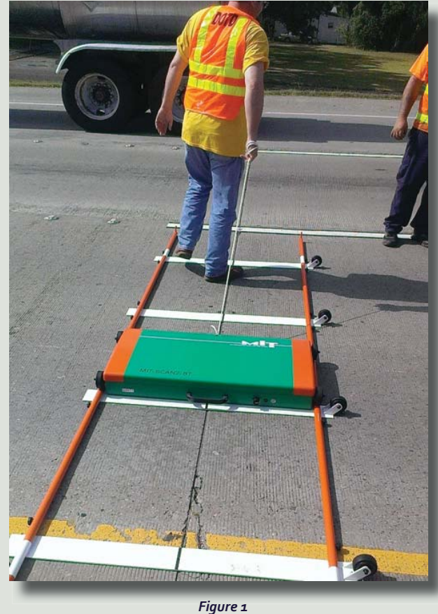
Figure 1 MIT-SCAN2-BT

The MIT-SCAN<sub>2</sub>-BT device is very capable of locating and measuring dowel bars and assemblies. It is also capable of determining whether or not a bar is missing, or if the load transfer device is something other than a dowel bar. The results also indicate that the effect of longitudinally translated dowel bars is negligible. Acceptable long-term performance was observed