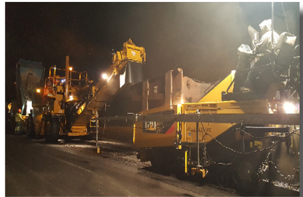
Figure 1 Mixture paving

The overall objective of this project is to evaluate the effects of increased asphalt pavement density on field performance. A demonstration pavement will be constructed to include a control section meeting the current minimum density requirement and a test section having an average 1.5 percent density increase, with subsequent evaluation of volumetric properties and performance characteristics of laboratory and field asphalt samples.