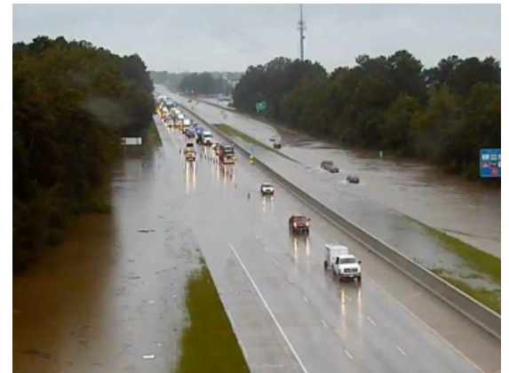
Figure 2. Flooded highway in Louisiana [3].