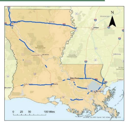
Figure 1. Spatial distribution of CMB segments in Louisiana

deral or State court pursuant to 23 U.S.C. § 407. The results from the observed crash analysis and the improved prediction method show that CMB is highly effective in reducing fatal and severe injury crashes, particularly for cross-median crashes. The cross-median fatal and severe injury crashes declined by 100%, and the total cross-median crashes were also reduced by 62%. For median-related crashes, a 51% and 7% reduction of fatal and