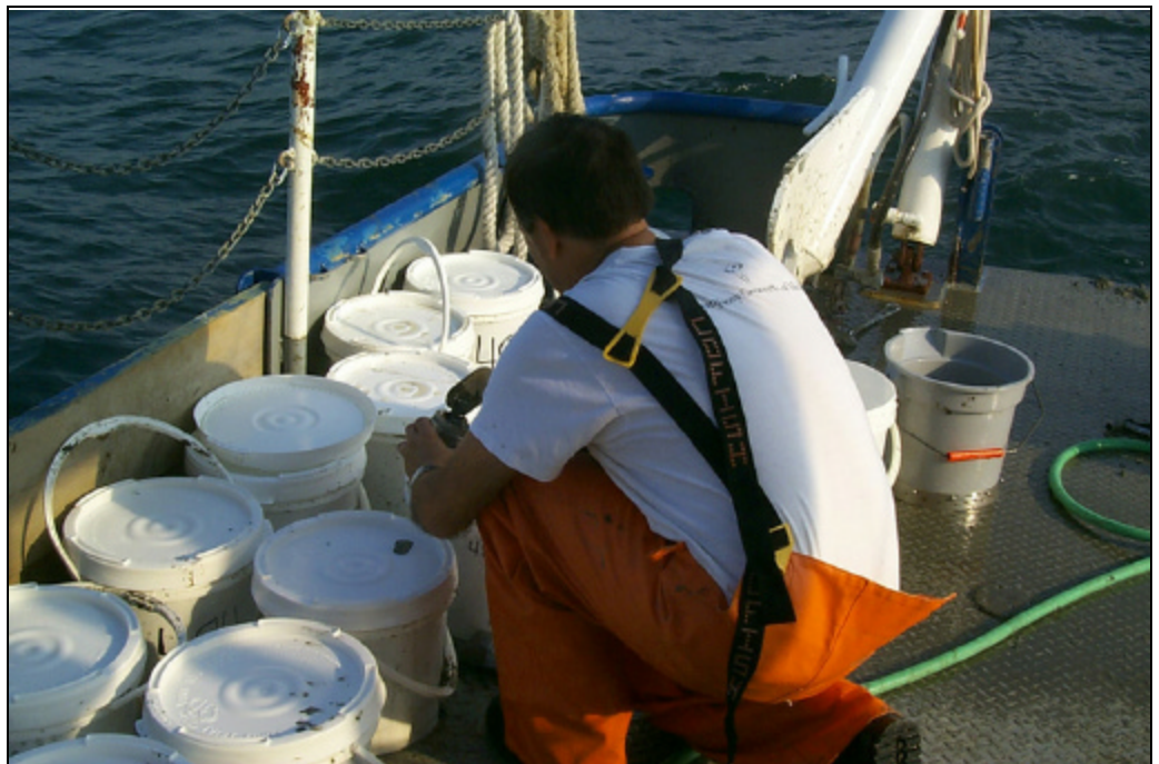
Packaging of Water Samples