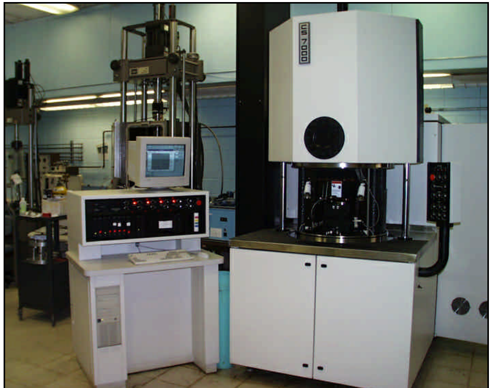
Superpave Shear Tester

This study will provide a comparative performance evaluation for different types of tack coat materials. It will identify an optimum type and application rate. The study will also provide an estimate of the interface shear strength that can be achieved by using tack coats of various types in a multilayered pavement. The research will help to improve pavement performance and minimize failure due to slippage.