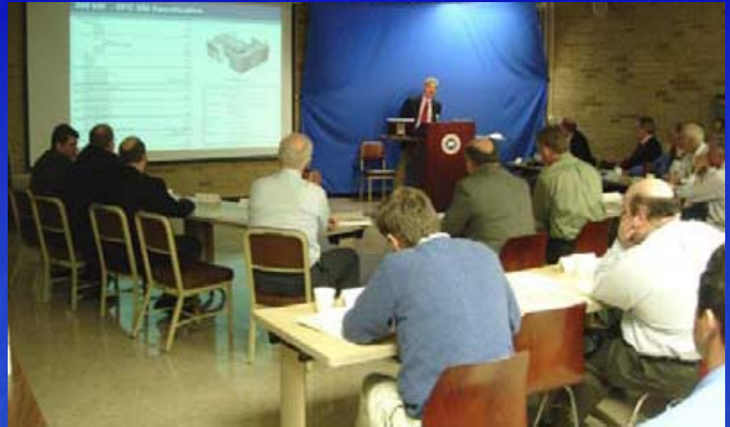
Back of room