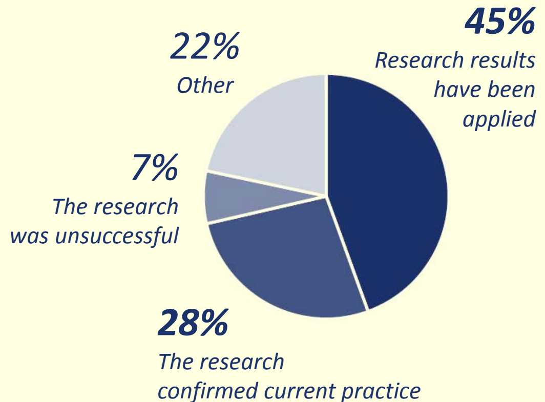
Project Outcomes Across All Responses