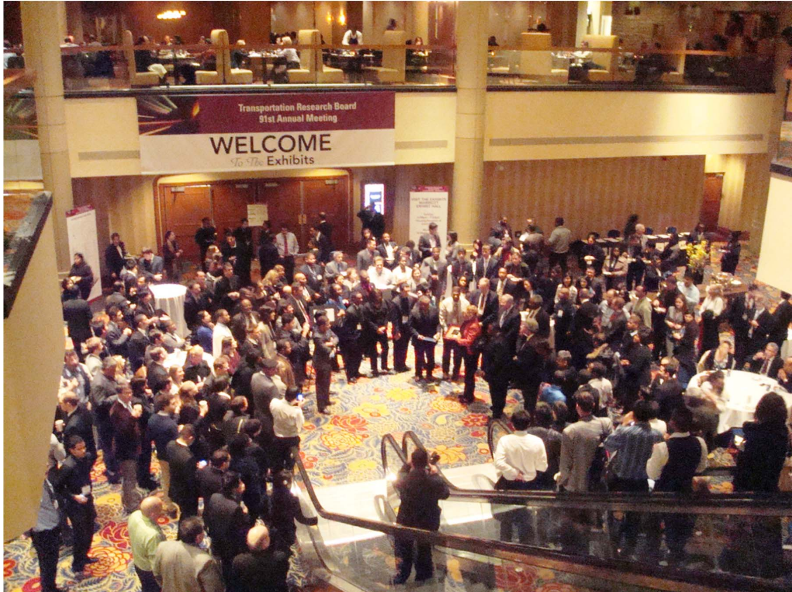
JOINT TRB STATE REPS-AASHTO RAC SUMMER MEETING