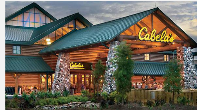
Cabelas Gonzales, LA