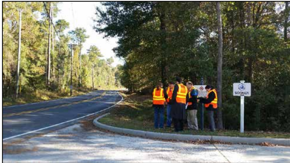
The Local Road Safety Program provides assistance in crash data analysis and field assessments during the project development process. Photo shows the LRSP Team working with local stakeholders and LADOTD in a recently held Road Safety Assessment (RSA) at a horizontal curve on a high-crash local road in St. Tammany Parish.

For more information on this program or assistance with data analysis and applications, please contact Rudynah Capone, LRSP Manager, at rudynah.capone@la.gov , or (225) 767-9718.