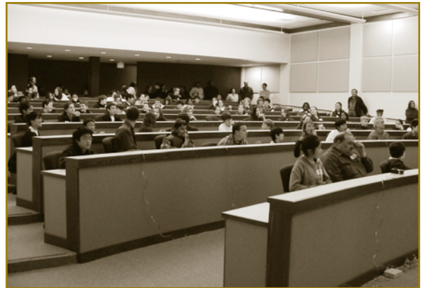
Local "mathletes" compete in the countdown round competition