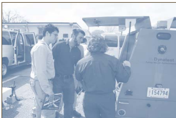
Students get a tour of LTRC’s mobile testing equipment.