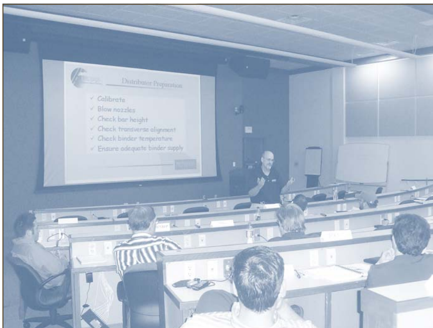
Chip Seal participants take part in a presentation on chip seal design, construction, equipment, and inspection.

For more information regarding TTEC's 2008 course offerings, visit the LTRC Web site at www.ltrc.lsu.edu .