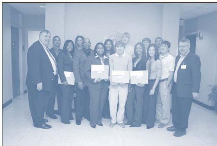
LADOTD Secretary poses with scholarship award recipients.

For further information, students may contact the Civil Engineering Department of their respective universities.