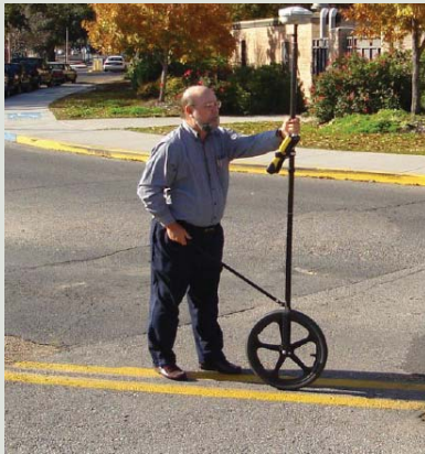
Figure 1 The author demonstrating RTK field technique with wheeled antenna rod

Researchers at C4G in cooperation with LADOTD accessed and measured the elevations and locations of points quickly and safely, along test sections of highways. LADOTD