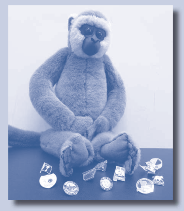
With each state Albert visits, a new pin is added to his collection.

to Huntsville, Alabama—home to the NASA facility where much of America's space program has been planned—he was named Albert in honor of the first monkey sent into space.