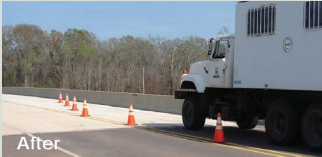
[Approach Slab continued]

were to lose its contact with the embankment. To validate or verify this new design, the approach slabs at Bayou Courtableau Bridge were fully-instrumented and monitored over a period of two years.