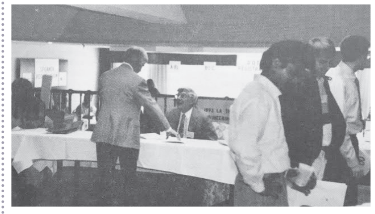
The 1993 Louisiana Transportation Engineering Conference

• In 1991, the Engineer Resource Development Program (ERDP) was established. This 32-week rotational program employs entry-level engineers that have their BS in engineering and FE certification, allowing them to have a comprehensive experience of all areas of DOTD engineering, spending 1-3 weeks in the various department sections, with a 7-week rotation at one of the 9 district offices in the state. Since its inception, over 95% of all engineer interns in the program have become full-time employees with DOTD. Approximately 90% have progressed in their careers and received certification as licensed PEs, with a