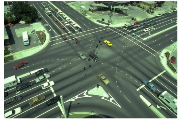
Figure 1. Vehicles at intersections and their trajectories [1]